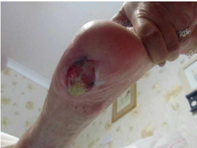
Image 1F Grade IV Pressure Ulcer Healing (month 3 marked improvement on a severe wound)