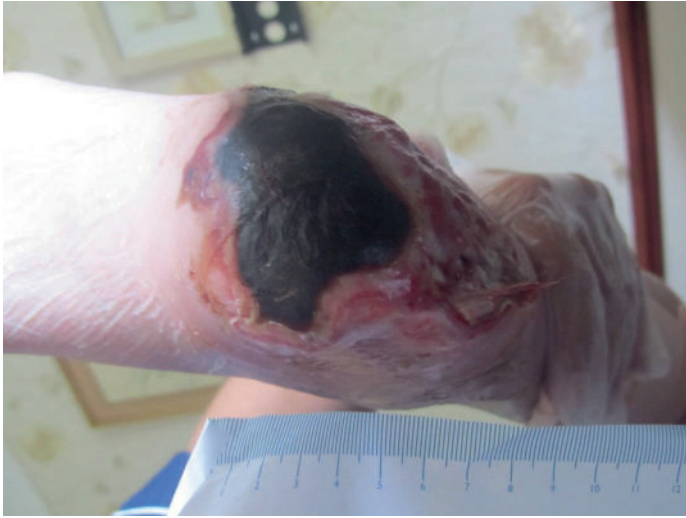
Image 1B Grade IV healing pressure ulcer healed (some debriding 2 - weeks into trial). Notes: Avon 6 EH mattress was implemented and combined with modern wound care products and nutritional support, along with extensive TV input. TVN ensured mental health was addressed and antidepressants commenced. Pain is controlled.