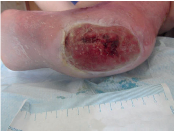
Image 1D Grade IV healing pressure ulcer healed (6 weeks into trial – various angles)