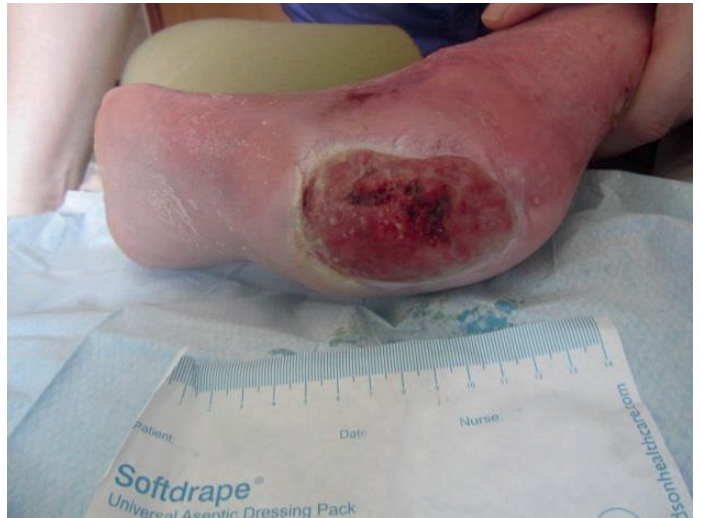
Image 1E Grade IV healing pressure ulcer healed (6 weeks into trial – various angles)