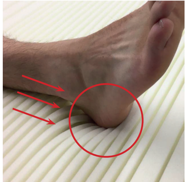
Image 1AA (above) – Representative image only – not part of this evaluation

The image shown represented a 3cm “drag force” reduction on this subject and represents an average of between 3 and 5cm drag distance when profiling a bed into the fowler position. See clinical reference below: ***Can pressure ulcers be prevented by using different support surfaces?