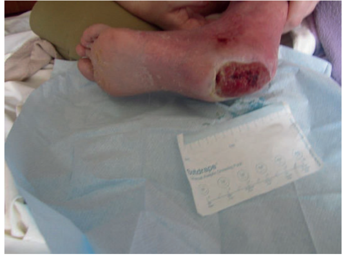
Image 1C Grade IV healing pressure ulcer healed (6 weeks into trial – various angles)