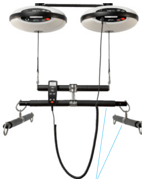
Spreader bars for Luna Twin, 400 kg Løftebøjle og fleksible side-løftebøjler Available in 360/480/580 mm