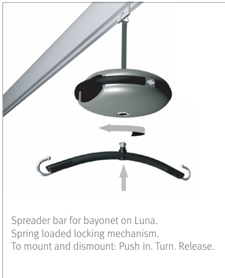
Spreader bar for bayonet on Luna. Spring loaded locking mechanism. To mount and dismount: Push in. Turn. Release.