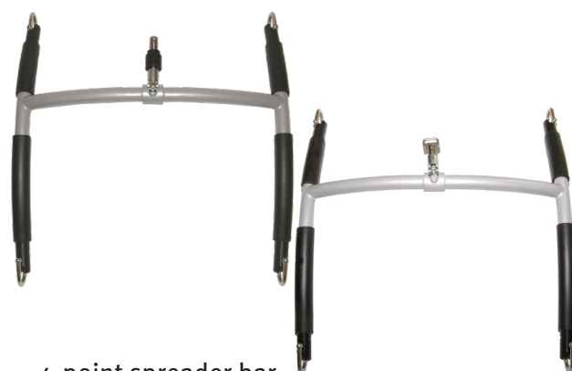
4-point spreader bar For bayonet or strap