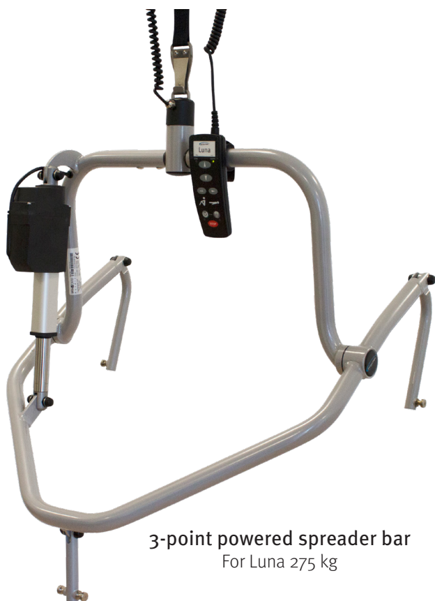
3-point powered spreader bar For Luna 275 kg