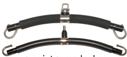
2-point spreader bar For bayonet or strap Available in 360/480/580 mm