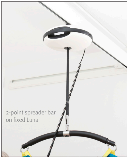
2-point spreader bar on fixed Luna